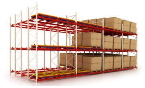
Racks on Mobile Platform